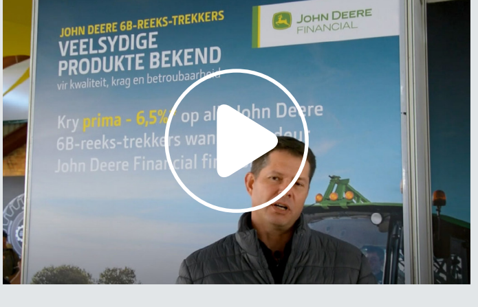
John Deere Africa Middle East | Nampo 2022 | John Deere Financial Note: this video is recorded in Afrikaans*

John Deere Financial | Flexible financing solutions Note: this video is recorded in English*