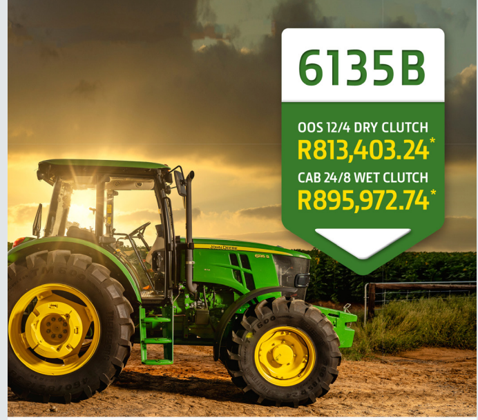
*Price excludes VAT and delivery costs. Available while stocks last. Available in South Africa, Eswatini, Namibia and Botswana only. Offer valid until 31 October 2022. Terms and conditions apply lavailable at www.deere.africa/en/current-offers/promotions/).

This offer does not include VAT or delivery and transportation costs. *Valid in South Africa, Botswana and Eswatini only. *Offer available until 31 October.