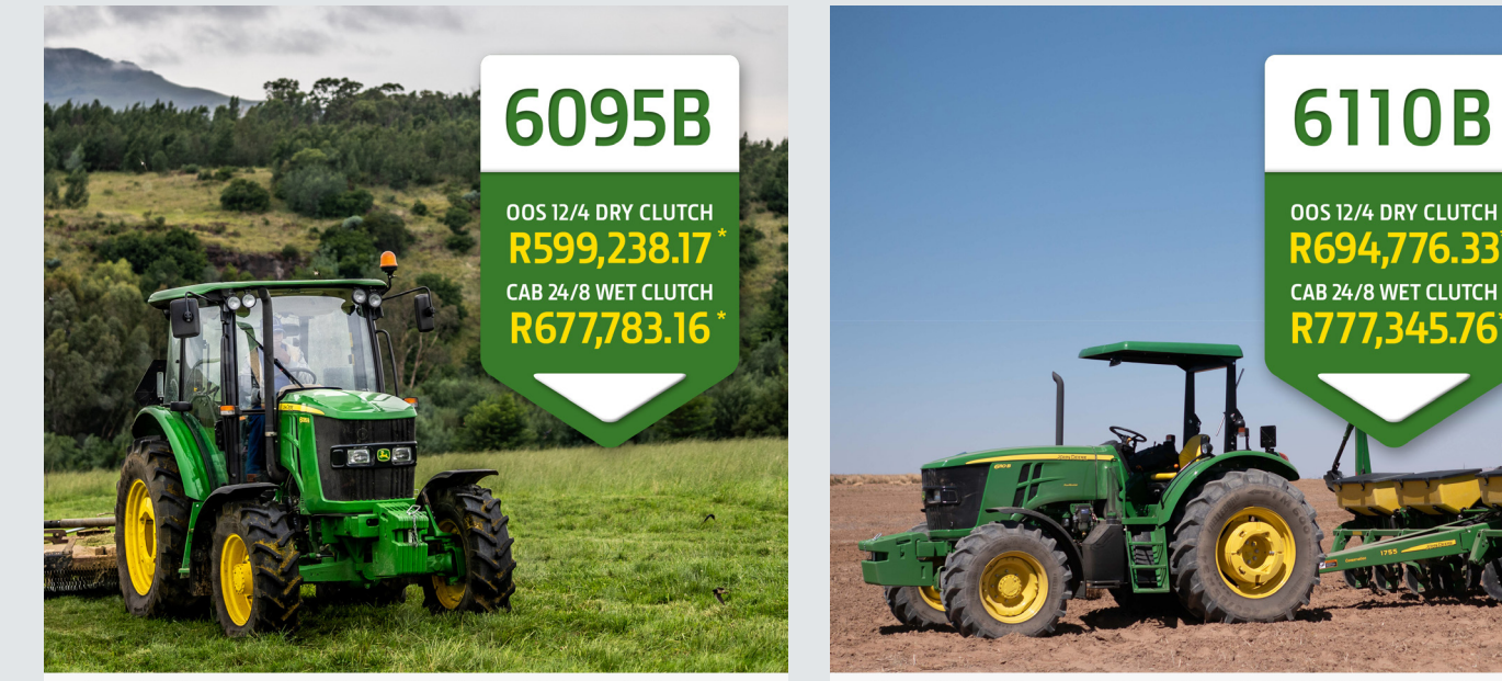
*Price excludes VAT and delivery costs. Available while stocks last. Available in South Africa, Eswatini, Namibia and Botswana only. Offer valid until 31 October 2022. Terms and conditions apply (available at www.deere.africa/en/current-offers/promotions/).

Customers can now own the John Deere 6B-Series Tractors for LESS: