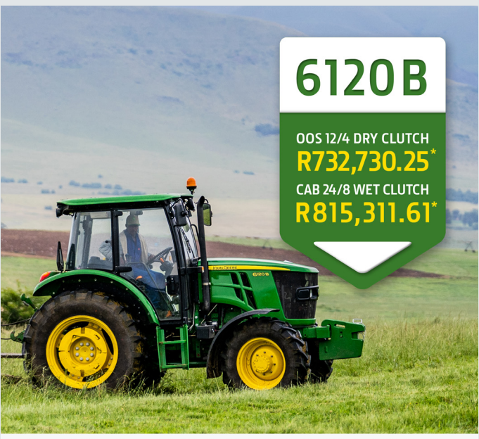
*Price excludes VAT and delivery costs. Available while stocks last. Available in South Africa, Eswatini, Namibia and Botswana only. Offer valid until 31 October 2022. Terms and conditions apply (available at www.deere.africa/en/current-offers/promotions/).