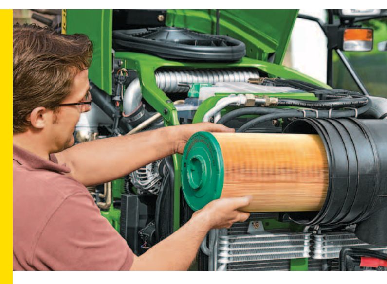
JDParts Keyword: "Filter"